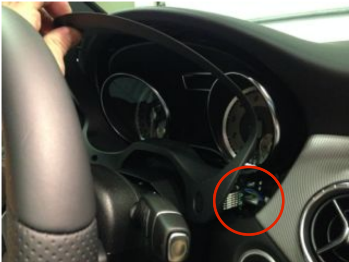
Remove bezel, Unplug HVAC sensor