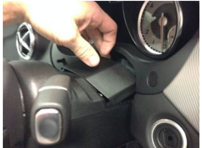
Pop off steering column cover