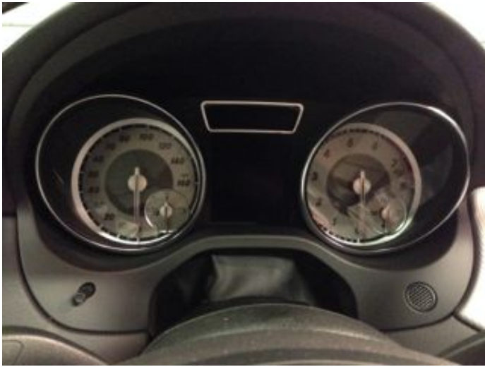
Begin to release bezel